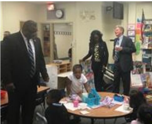
Congressman Pallone's Visit